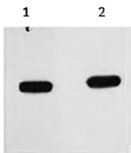
Fig. Western blot analysis of mCherry recombinant protein, diluted at 1) 1:5000, 2) 1:10000.

Note: The product listed herein is for research use only and is not intended for use in human or clinical diagnosis. Suggested applications of our products are not recommendations to use our products in violation of any patent or as a license. We cannot be responsible for patent infringements or other violations that may occur with the use of this product.